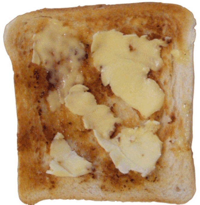
Fat spread on white bread