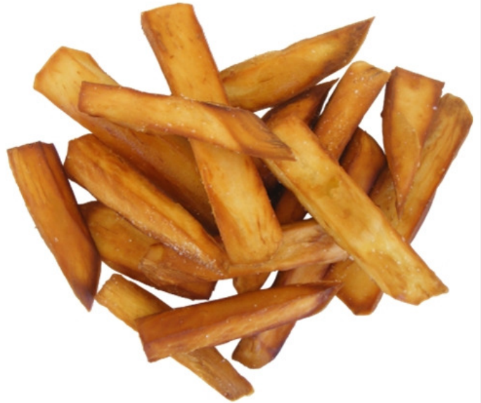
Fried sweet potato chips