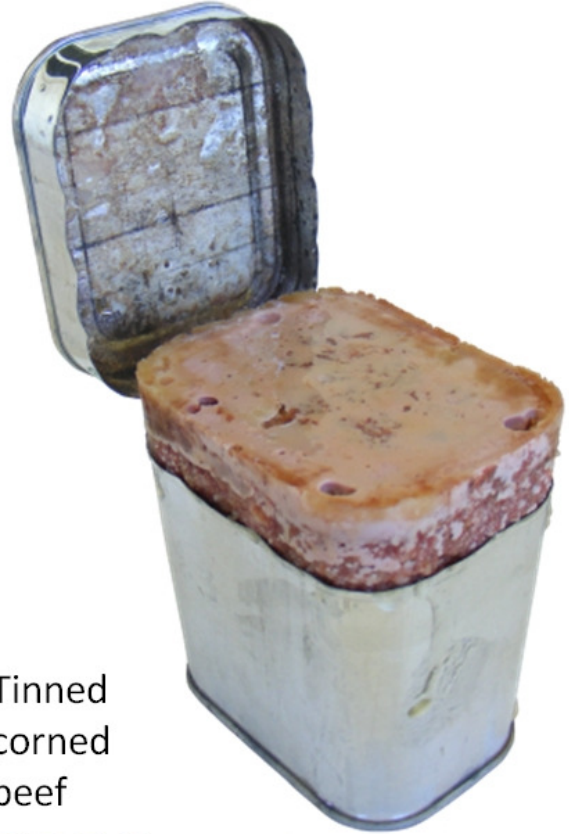
Tinned corned beef